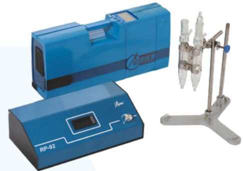
RA-915 M + RP-92

The Lumex Instruments RA-915M mercury analyzer, equipped with a special cold vapor accessory, can perform conventional cold vapor atomic absorption spectrometry (CVAAS) technique for the determination of mercury in surface, ground, drinking and waste water as well in atmospheric precipitation.