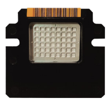
Stainless steel microchip with 48 microreactors.