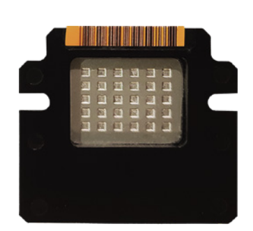
Aluminum microchip with 30 microreactors

Flexibility and customization due to customer request FDA 21 CFR part 11 compliant software