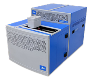
RA-915 Lab mercury analyzer