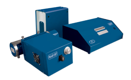
RA-915F mercury analyzer