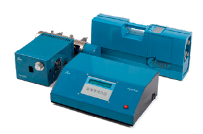
RA-915M mercury analyzer with PYRO-915+ attachment

Coal sample 6H 0237 (m1 = 87 mg, C1 = 58 ppb; m2 = 70 mg, C2 = 64 ppb; m3 = 76 mg, C3 = 57 ppb), Cav = 60 ppb, RSD = 6%